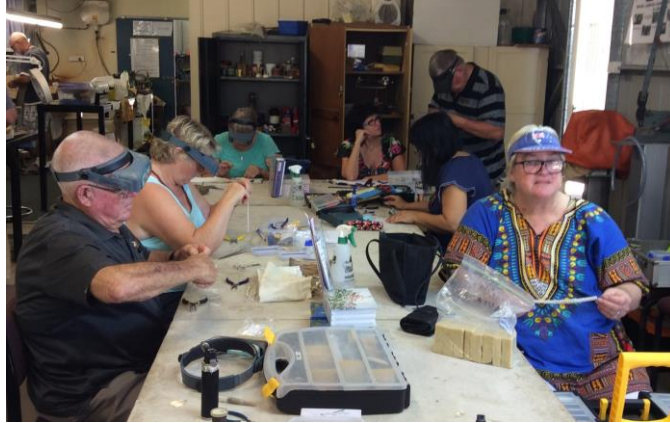
A very industrious wire wrapping group

These sessions are on each of the full Saturday session (the Second and Last Saturdays of the month). There are no tuition costs but wire consumables are at cost and, of course, club fees are payable.