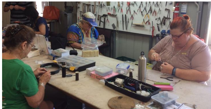
Still hard at it

Chain Maille students have learnt several different weaves and are now branching out onto the web to get online tutoring. 1:1. 2:1. 2:2. Byzantine, twisted bracelets to name a few and combining these weaves with various stones and beads.